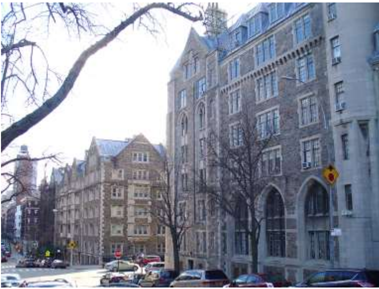
Figure 7. McGiffert Hall secondary façade (right), with Union Theological Seminary (left), view east. Gregory Dietrich, Photographer 1/24/18