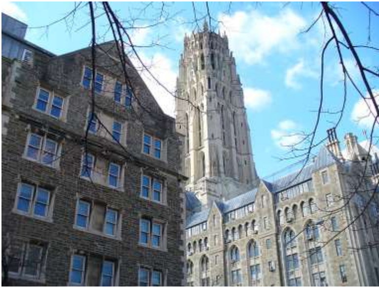
Figure 4. McGiffert Hall (lower right), surrounded by Union Theological Seminary (left), and Riverside Church (top), view southwest.