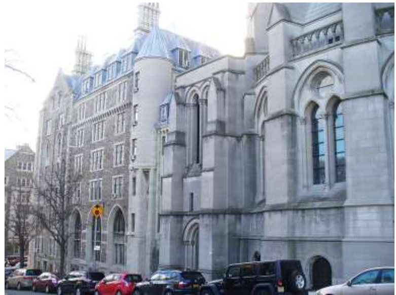
Figure 8. McGiffert Hall secondary façade (left), showing turret connection to Riverside Church (right), view southeast. Gregory Dietrich, Photographer 1/24/18