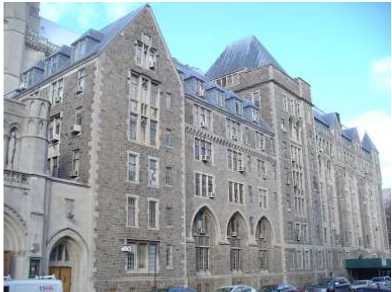
Figure 5. McGiffert Hall primary façade along Claremont Avenue, view northwest. Gregory Dietrich, Photographer 1/24/18