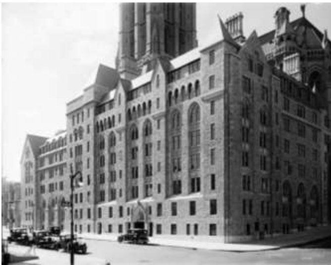
Figure 2. McGiffert Hall, c. 1931.