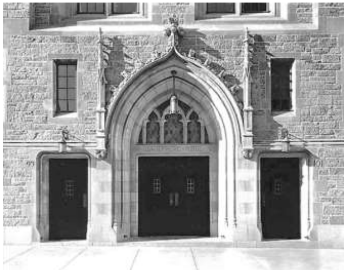
Figure 3. McGiffert Hall main entry detail, c. 1931.