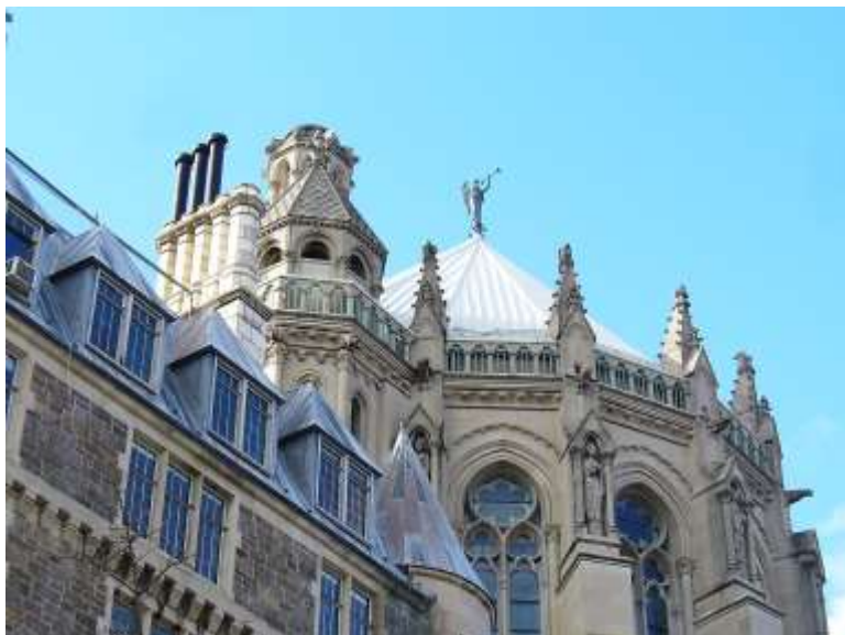
Figure 9. McGiffert Hall secondary façade rooftop detail (left), with Riverside Church apse in the background, view southwest. Gregory Dietrich, Photographer 1/24/18