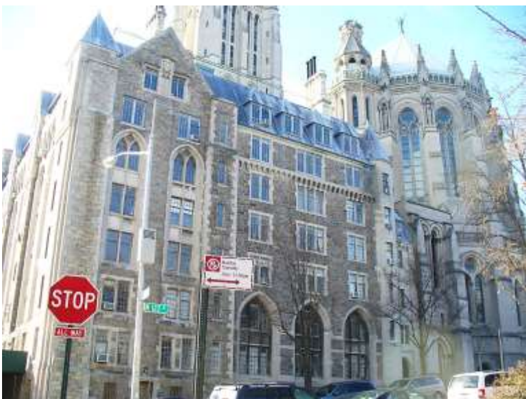
Figure 6. McGiffert Hall secondary façade (left), with Riverside Church (right and top), view south. 1/24/18